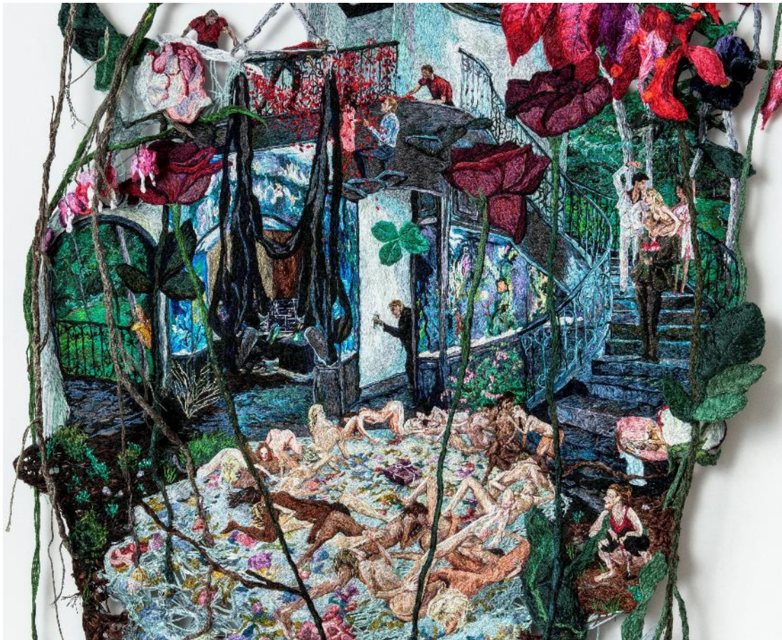
Sophia Narrett, Right Before (detail), 2017-18